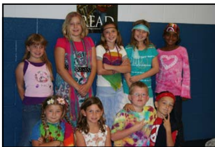
Students join in 70s Spirit Day

Please help review your student's homework and planner. Communication with the teacher is essential and will open doors to great things. If you are involved in your student's academics, they will reap the rewards of all the